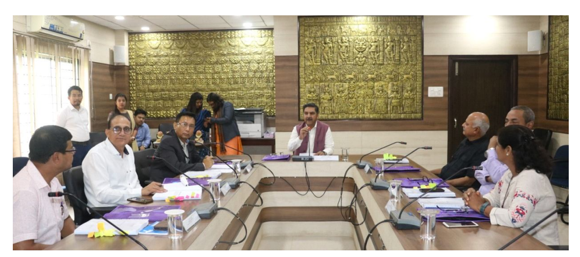
Meeting of the Academic Council constituted as per the statute of the University, held on 11th April 2022.

An Adhoc Academic and Activity Council of the University was constituted by the University vide Notice No. SASU/CHB 30/2020/43 dated 23/09/2020 and accordingly three meetings of the Adhoc Academic and Activity Council were held during the period.