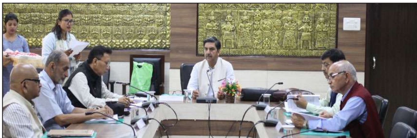
Review Meeting on finalizing the draft IDP on June 5, 2023