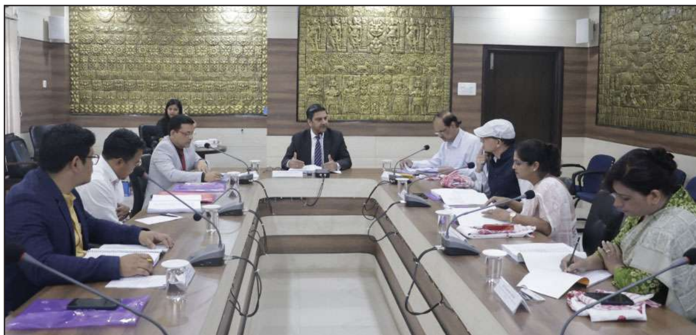
Eighth Meeting of the Academic and Activity Council of SASU held on June 7, 2023

Subsequently, the 9 th meeting of the Academic & Activity Council was held on 22 nd March 2024 at 11:30 AM in the Conference Hall of Dibrugarh University Guest House where detailed discussions regarding the ordinance and regulations for the 4-Year BPE (Hons./ Hons. With Research), curriculum structure and syllabus and SOP for the admission process were discussed in detail.