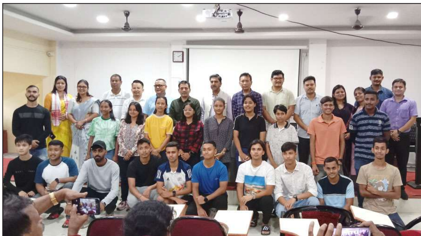
Inauguration of the first batch of 4-Year Bachelor of Physical Education (Hons./Hons. with Research) 2023-24, held on August 25, 2023.

Accordingly, the 'Deeksharambh' (Orientation program) scheduled for the 1st-semester students of Bachelor of Physical Education (Hons. / Hons. With Research) was held on 25 th August 2023 as per the detailed Agenda in the premises of DHSK College, Dibrugarh. The students were briefed about the University and the program in detail by the Dean, School of Human Kinetics & Health, SASU.