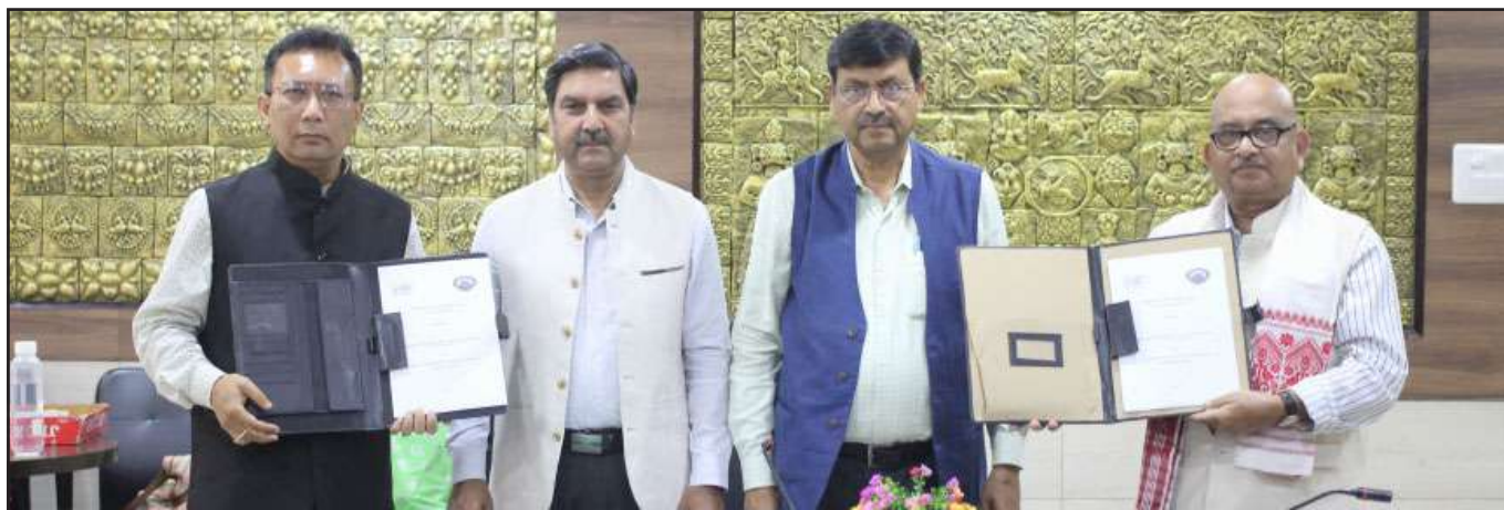
MoU signed between SASU and KKHSOU on June 5, 2023