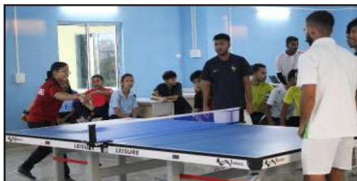
Table Tennis, Rackets, Football, volleyball, etc have also been purchased for conducting the practical classes of the 4-Year Bachelor of Physical Education (Hons./Hons. with Research) program. Volleyball and football fields are also developed by the University at DHSK College premises for conducting practical classes.