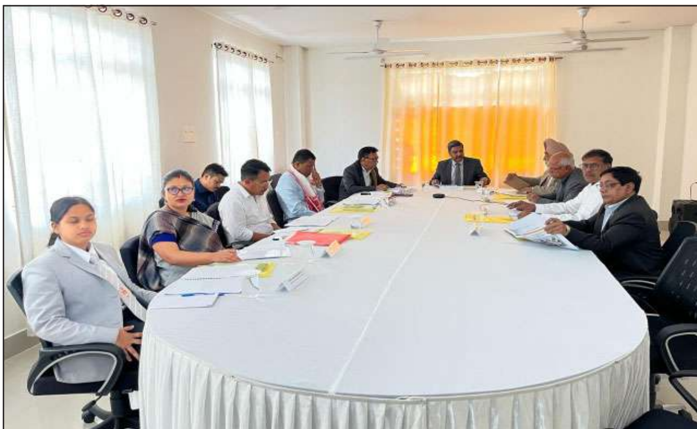
Second Court Meeting of SASU held on March 16, 2024.

Therefore, the discussions held during the meeting were vital in shaping the University's policies and priorities. Overall, the meeting provided an essential platform for the members to discuss and deliberate on the University's operations and prospects.