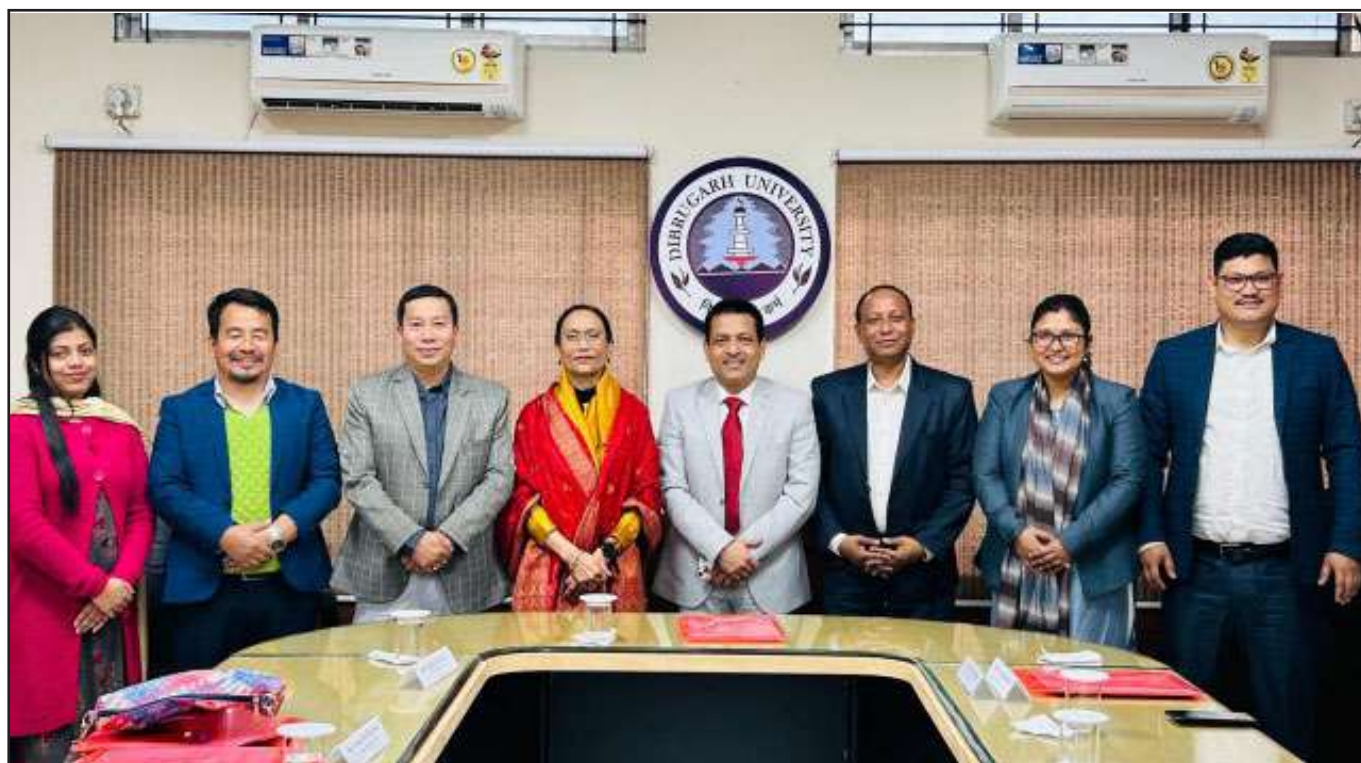
Sixth Meeting of the Board of Studies (BoS) of SASU held on March 4, 2024.

The University convened the 6th meeting of the Board of Studies (BoS) on 4 th March 2024 following Office Notification No. SASU/CHB/58/2020/1795 dated 01/02/2024. The primary agenda of the meeting was to discuss and revise the minor changes in the courses of BPE (Hons. / Hons. With Research), common standard format for question paper, to amend the academic regulation of the University etc. All the members of the Board of Studies attended the meeting.